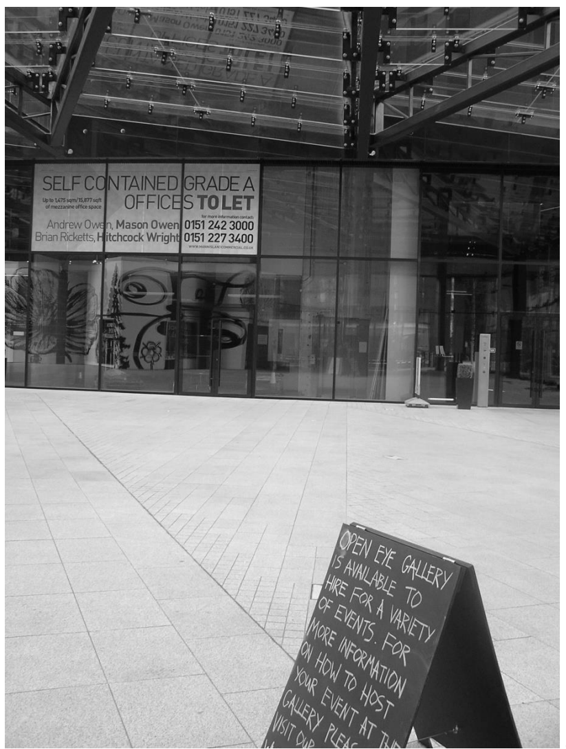
space: the concretising frontier