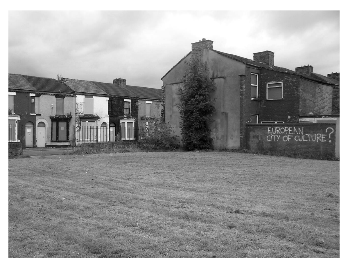
This is culture: 'Stop Me If You Think You've Heard This One Before'