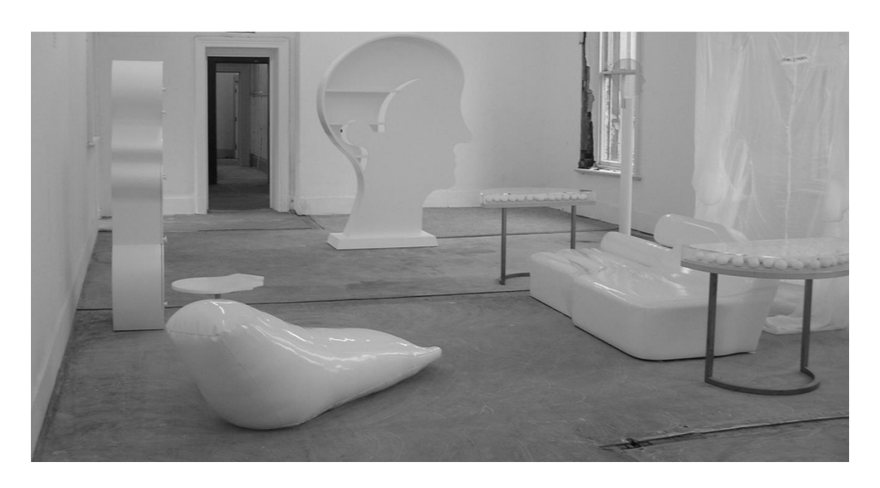
affordable dreams and relaxing rooms of emptiness; a biennial of many couches